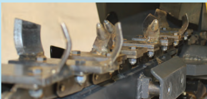
Chain with mixed soil blades and bullet teeth