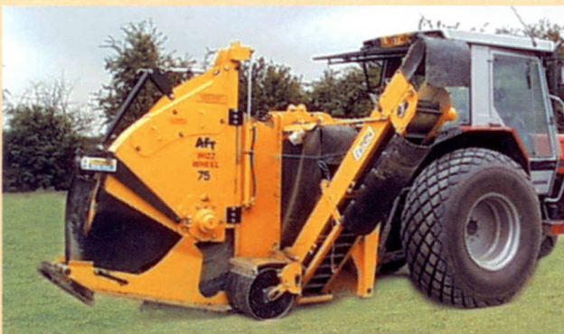
WIZZ WHEEL 75

Through increasing demand for a more flexible machine, the AFT 75 Wizz Wheel is capable of both digging and grading main drains up to 750mm deep and 125mm wide, together with gravel banding or sand slitting as narrow as 50mm. The more compact Wizz Wheel 55 is used by many golf clubs looking to incorporate a large amount of intensive sand slitting or gravel banding into existing main drains.