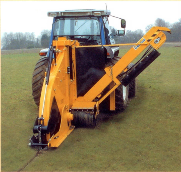
WIZZ WHEEL 75

With constantly increasing demands on sports turf in the leisure and professional sectors, optimum pitch or playing surface condition is paramount. Intensive drainage is considered to be an important measure taken to both enhance turf condition and cope with today's demands.