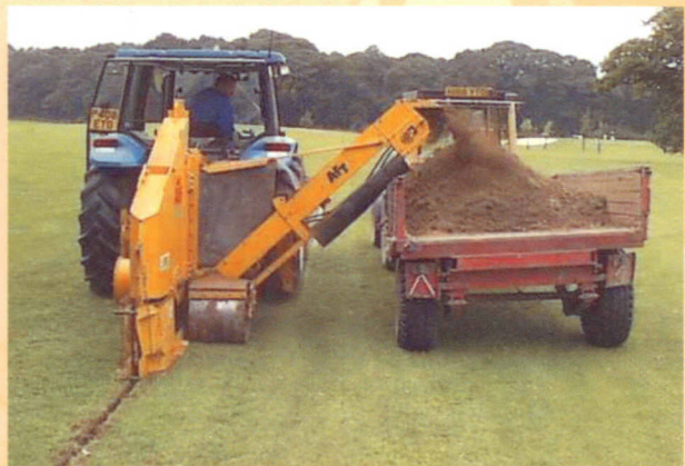
WIZZ WHEEL 55

Through increasing demand for a more flexible machine, the AFT 75 Wizz Wheel is capable of both digging and grading main drains up to 750mm deep and 125mm wide, together with gravel banding or sand slitting as narrow as 50mm. The more compact Wizz Wheel 55 is used by many golf clubs looking to incorporate a large amount of intensive sand slitting or gravel banding into existing main drains.