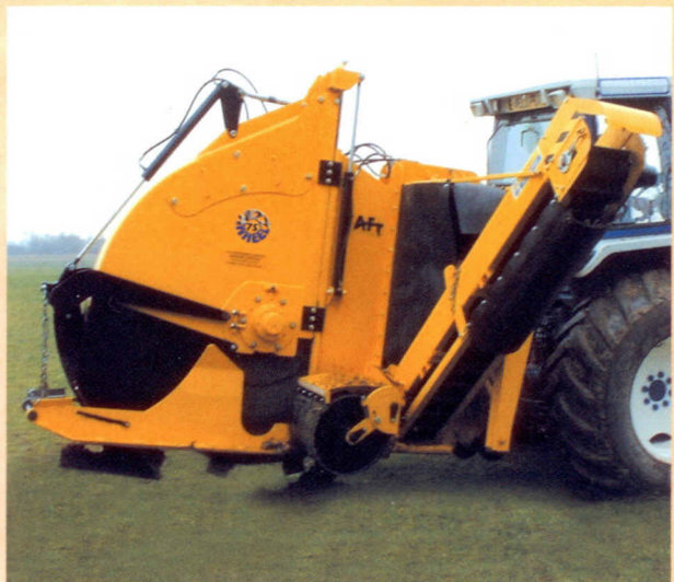
WIZZ WHEEL 75

AFT Trenchers offers two powerful tractor mounted, PTO driven slit trenchers. These machines have been proven to be the ultimate solution to a fast, clean and cost effective means of installing and maintaining intensive drainage systems by leading golf clubs and contractors world wide.